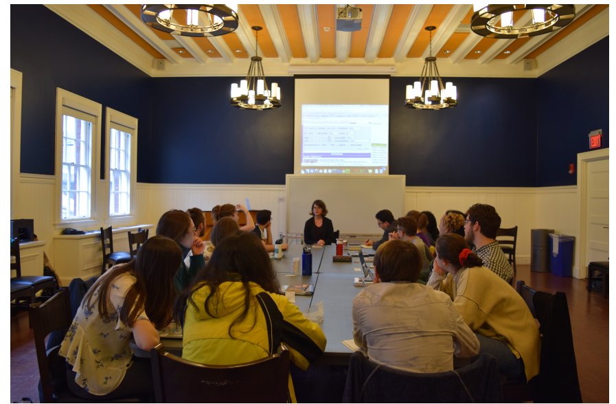
TDM Sophomore Tutorial