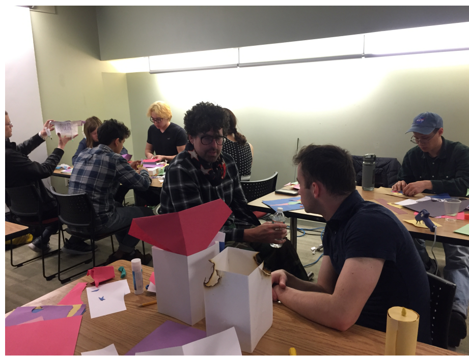
Master Class with Machine Dazzle