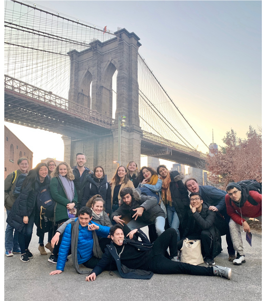
TDM Sophomore Tutorial, Junior Tutorial, and Live Art from the Archives courses visit to NYC