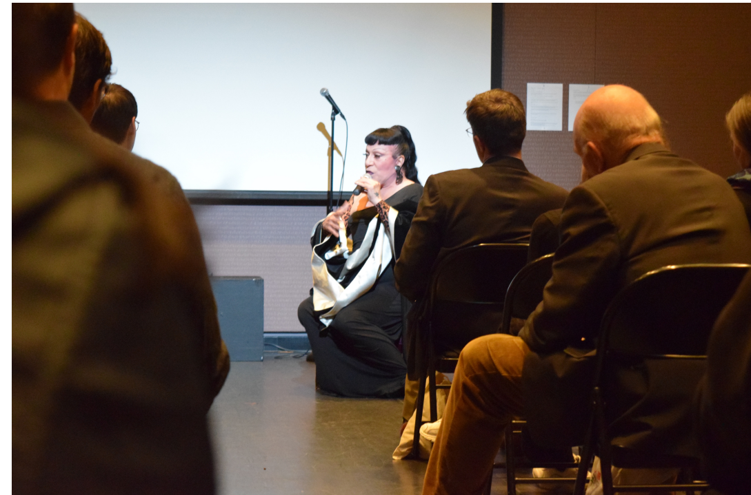
An Evening with Joey Arias: Performance & Talk