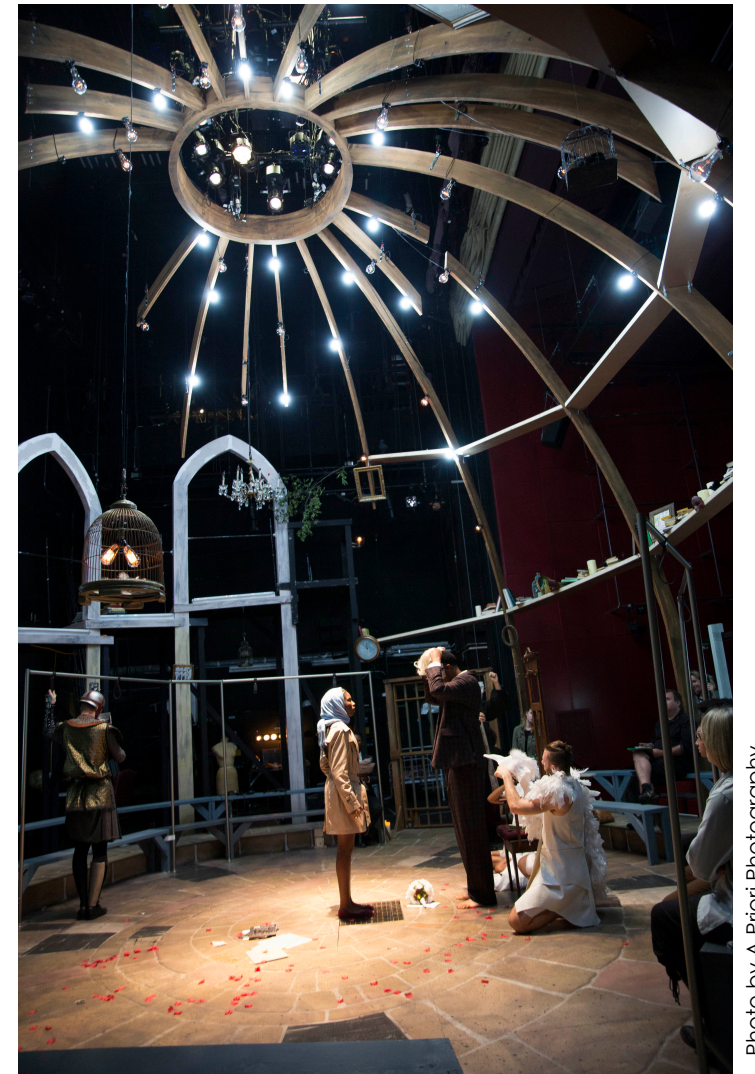
TDM Production: The Owl Answers (Fall 2017) directed by David Gammons

No. We are not a conservatory-style program, though we do offer conservatory-style courses, but we do not require students to audition or apply to join the concentration. Some of the specific classes do require an audition or application, as they have a cap on the number of students that can take the class. Classes note this information on their my.harvard.edu course listings.