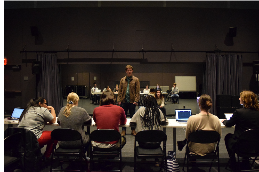
TDM 98 Junior Tutorial